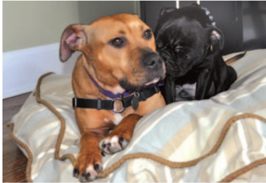
She now has a chance to turn the world on with her smile. Mary Tyler Moore, left, known as Momo, relaxes with her friend Creature at Animal Farm Foundation in New York after being rescued last fall from an alleged dogfighting operation in Ohio. In April, Momo got adopted by her foster family.