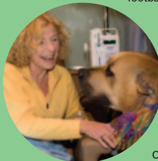
Leo and a patient